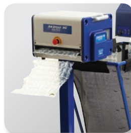
HC AutoFlow ™